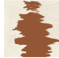
Clay/Swiss - LN006- 2