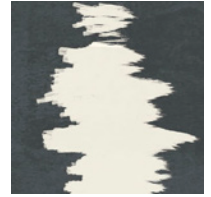
Swiss/Pewter - LN006-3