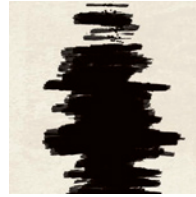
Black/Swiss - LN006-1